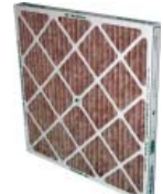
Available in UL Class One for locations having this building code requirement. Request Product Sheet 1002CL1.